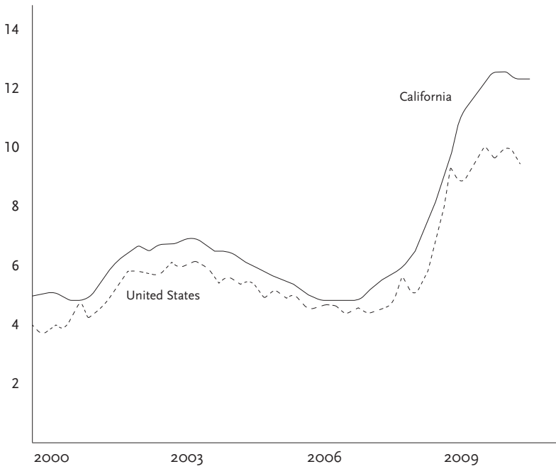
FIGURE 2. Unemployment rate (%)